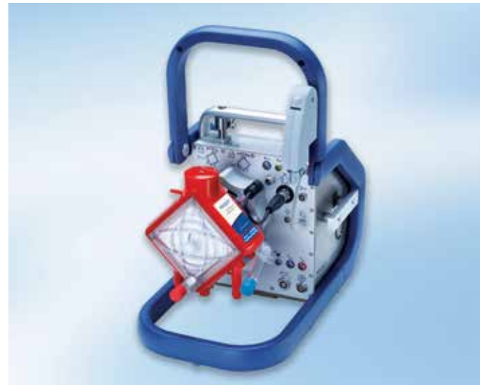
CARDIOHELP with the HLS Module Advanced attached

The HLS Module Advanced is available in two versions: for a blood flow of up to 5.0 l/min (HLS Module Advanced 5.0) and up to 7.0 l/min (HLS Module Advanced 7.0).