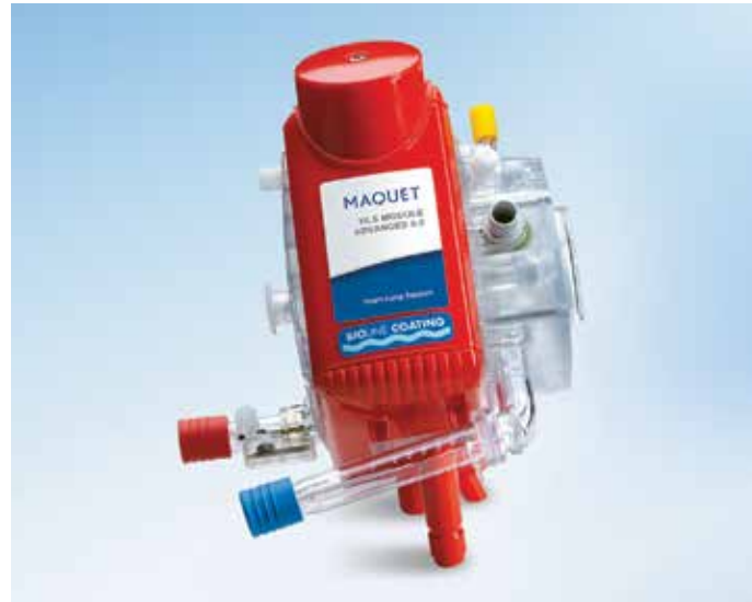
HLS Module Advanced

Until now, a patient's blood parameters were measured using an external blood analysis device or a sensor in blood-carrying tubes.